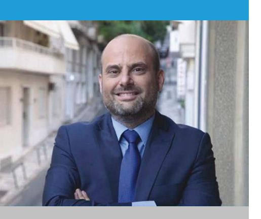
The Governor of the NTA

Within the first four months of its operation, the Authority managed to successfully implement a very demanding management plan for change by completing the integration of the six bodies and the addressing organizational and operational dysfunctions of years. At the same time, there was not a day of operational inactivity. From the very beginning, the Authority exercised all its responsibilities thanks to the experience and tireless efforts of the staff and the management team. Statistical data show that the Authority has produced measurable and high-quality work in all three of its operations pillars, Control - Prevention - Awareness, and managed to create strong links with society and high expectations for continuity.